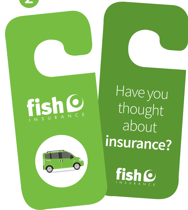
Rear view mirror hangers