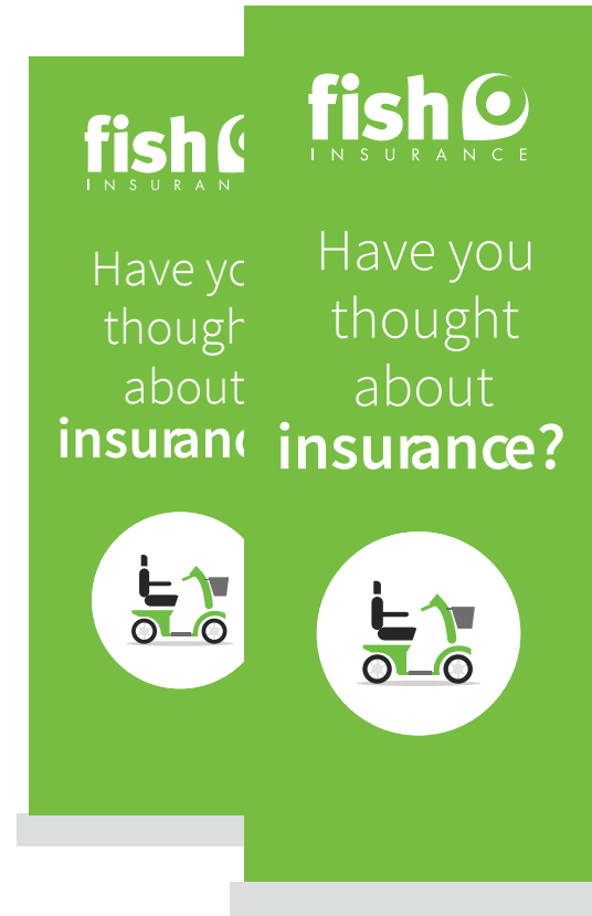
Pull Up Banners