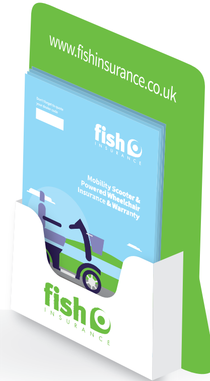
Leaflets and dispenser