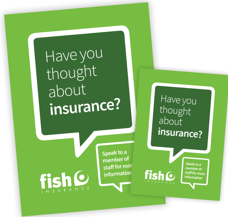
Posters A4 and A3